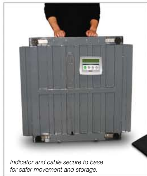
Indicator and cable secure to base for safer movement and storage.